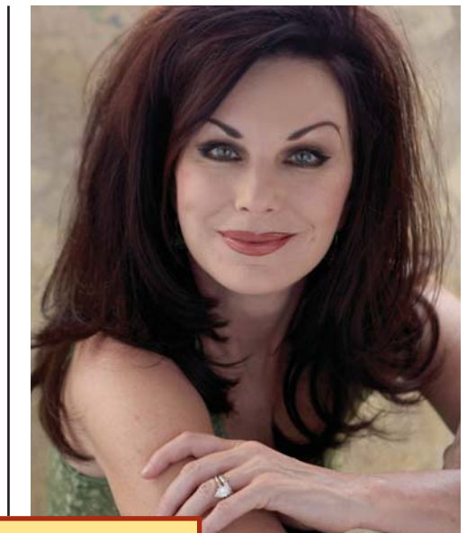
GDC Annual Dinner Meeting Wednesday, January 17, 2007 Holiday Inn Hotel & Suites