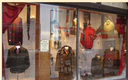
Barbo's Columbia Clothing