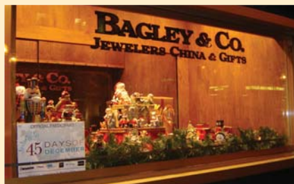
Bagley & Co. Jewelers