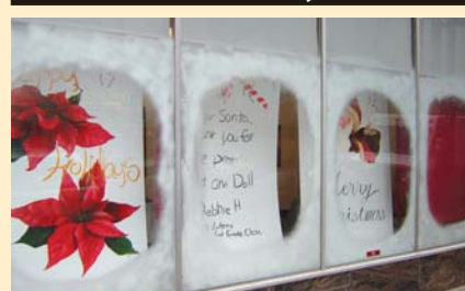
ZLB Plasma Services