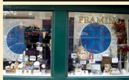
GREATER DOWNTOWN COUNCIL