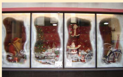
Clear Channel Radio