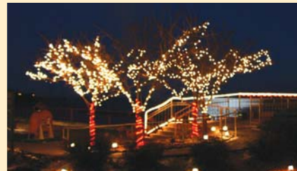
Fitger's Brewery Complex