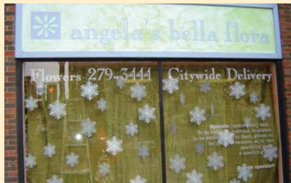
Angela's Bella Flora