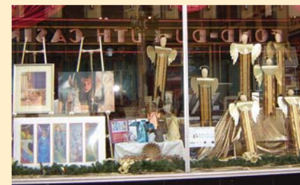
Art Options Gallery