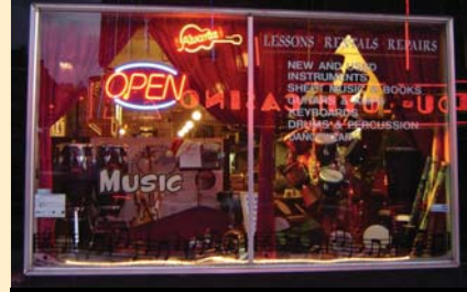
Great Northern Music