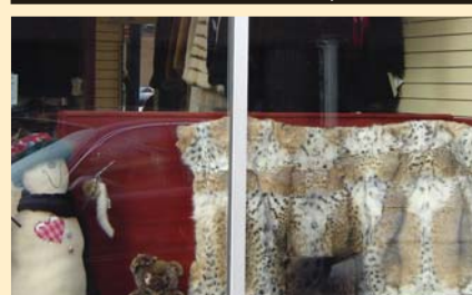
USA Foxx & Furs