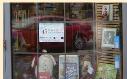
Northern Lights Books & Gifts