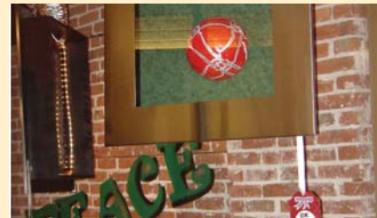
Frame Corner Gallery