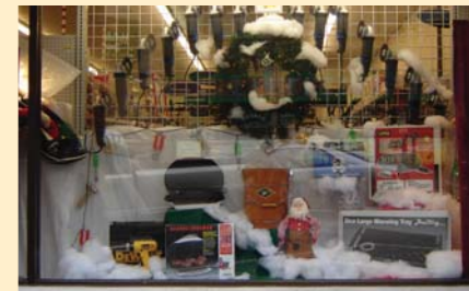
Ace Hardware Downtown

Individuals are encouraged to vote for their favorite window, which automatically enters them into a drawing for the two Downtown gift packages on display at 38 E. Superior Street. Merchants generously donated nearly $4,000.00 worth of items; enough to fulfill anyone's wish list this Christmas. A huge thank you to those merchants who contributed and the visual merchandising team at Maurices who worked tirelessly to assemble the display. GDC