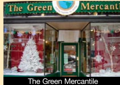
The Green Mercantile