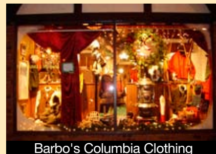
Barbo's Columbia Clothing