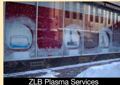
ZLB Plasma Services