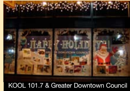
KOOL 101.7 & Greater Downtown Council