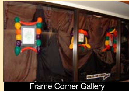
Frame Corner Gallery