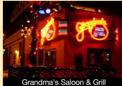
Grandma's Saloon & Grill