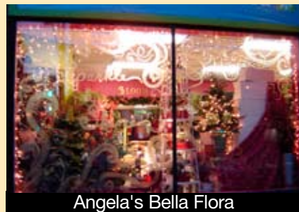
Angela's Bella Flora