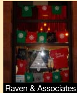
Raven & Associates