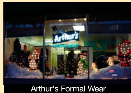
Arthur's Formal Wear