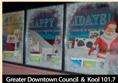
Greater Downtown Council & Kool 101.7