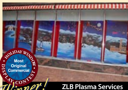
ZLB Plasma Services