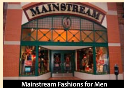
Mainstream Fashions for Men