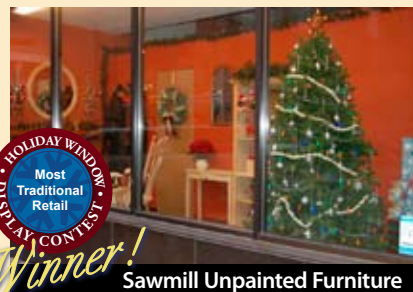
Sawmill Unpainted Furniture