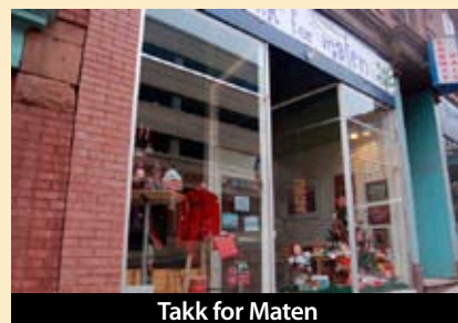
Takk for Maten