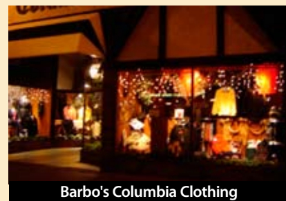
Barbo's Columbia Clothing