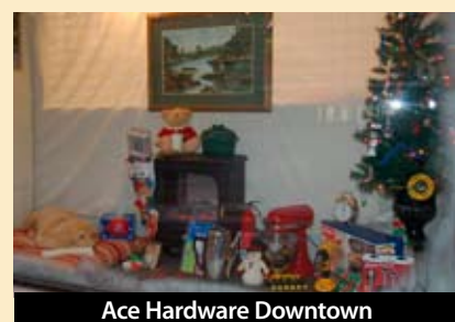
Ace Hardware Downtown

There is still plenty of time in the Greater Downtown Council's 45 Days of December campaign to grab your list and check it twice. "It's a Wonderful Night" is a new downtown shopping event to be held on Thursday, December 18th. Just in time for the last minutes shoppers, on this exceptional night you can enjoy extended holiday shopping hours, unique deals, and after-parties at Dubh Linn Pub and Baja Billy's at Fitgers featuring free appetizers and drink specials. GDC