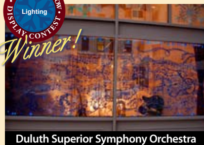
Duluth Superior Symphony Orchestra